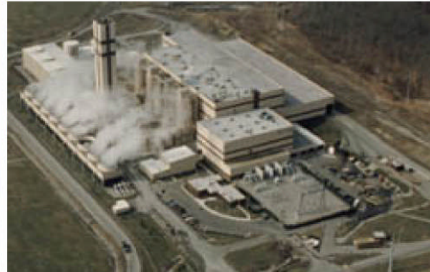
816 Covanta Alexandria, VA, WTE Facility (975 Tons Per Day)