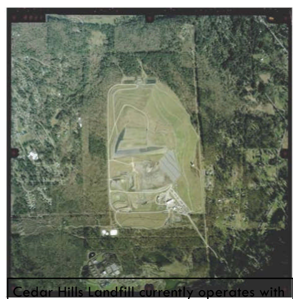
a 1,000 foot buffer leaving up to 900 feet of usable space.

Second is to take advantage of the 900-feet of extra buffer zone around the Cedar Hills Landfill's perimeter and especially along the south side of the Landfill which the County is not currently using. A Buffer zone means that part of a facility which lies between the active area and the property boundary. Washington State's requirement of a buffer zone distinguishes between residential and non-residential neighbors. For nonresidential, Washington State's requirement is a buffer zone of 1 00 feet. The buffer zone for residential neighbors is 250 feet.<sup>5</sup> The Cedar Hills Landfill, however, is designed with a 1,000feet buffer. The GBB Team understands that the County had promised the community to provide extended buffer area where the landfill is adjacent to residential homes. Even so, 1,000feet is more than generous. On the south side of the facility, however, the neighbor is a