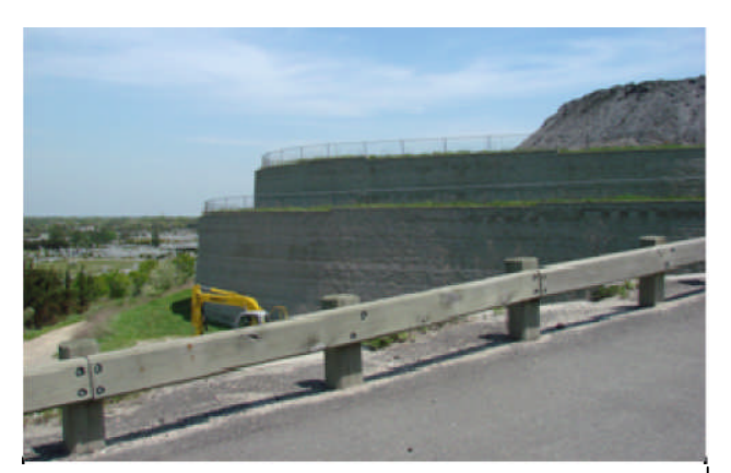
Town of Babylon uses walls on its landfill to maximize space.