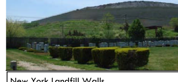
New York Landfill Walls