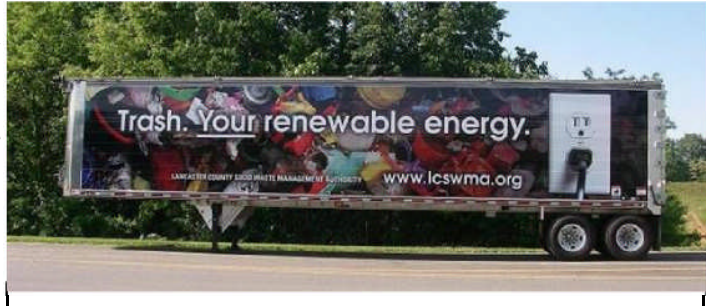
Messages should be integrated and attractive. Lancaster County, PA transfer trailer

1106 All facilities should have a coordinated 1107 education that integrates messages, 1108 information, and color in its signage, 1109 brochures, call centers, public meetings, 1110 and public service announcements. The 1111 message of keeping King County Clean 1112 and Green should be emphasized. Each facility should have a kiosk of 1113 1115 environmental information that 1117 customers can use and the employee