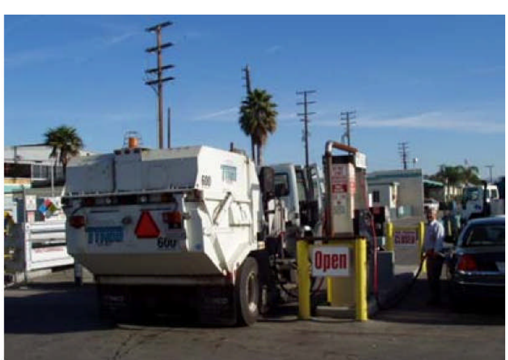
Quick fueling compressed natural gas (CNG) in Santa Monica, CA