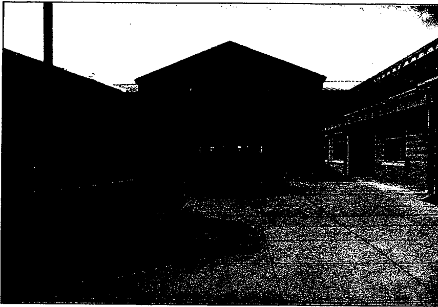
Auburn Mountainview High School