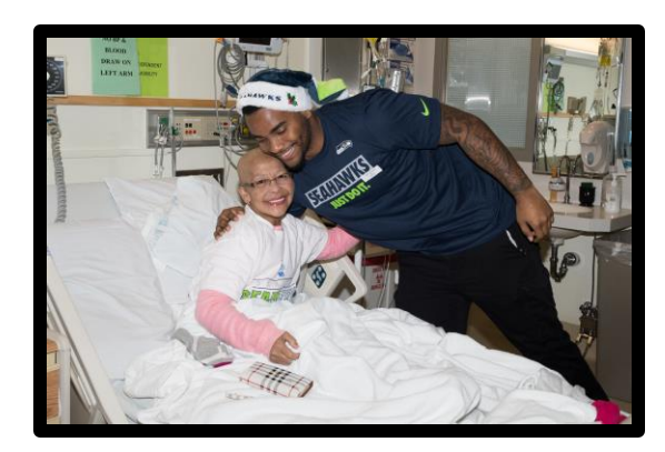
Captains Blitz at Seattle Children's