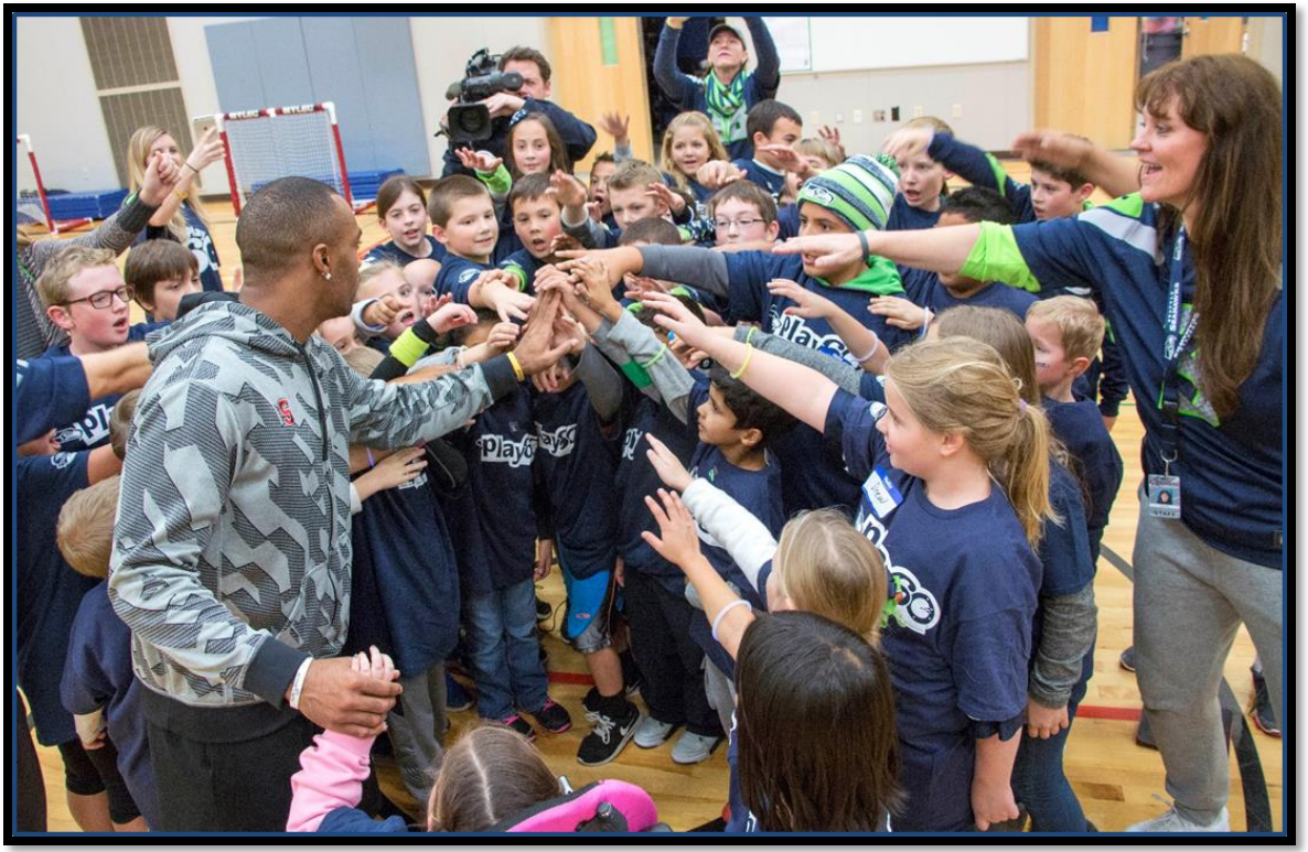
Doug Baldwin at Lakeland Hills Elementary for Play 60 Tuesdays