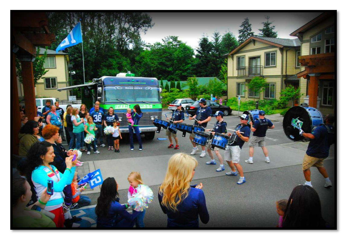
Sea Hawkers and Blue Thunder at Ronald McDonald House