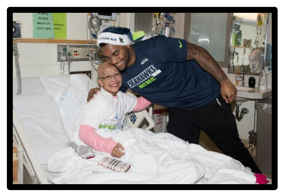
Captains Blitz at Seattle Children's