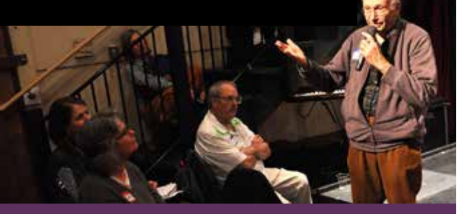
LGBTQ Senior Housing As "out" and empowered LGBTQ seniors age into their retirement years, we're laying the groundwork to build Seattle's first LGBTQaffirming affordable senior housing.