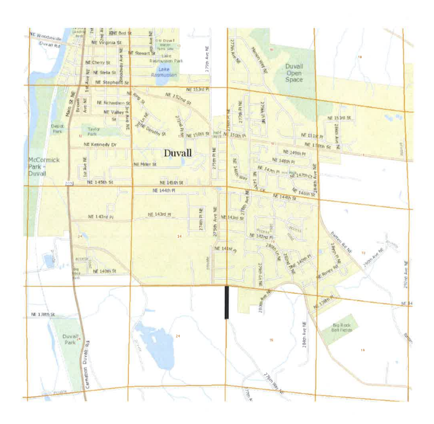
Black shading identifies area redesignated as 276<sup>th</sup> Way NE.