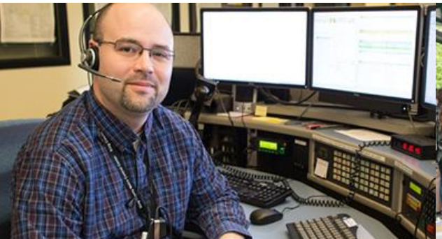
Data Mgmt. & Smart Cities