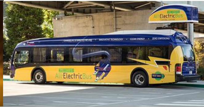
Electric, Connected, Automated