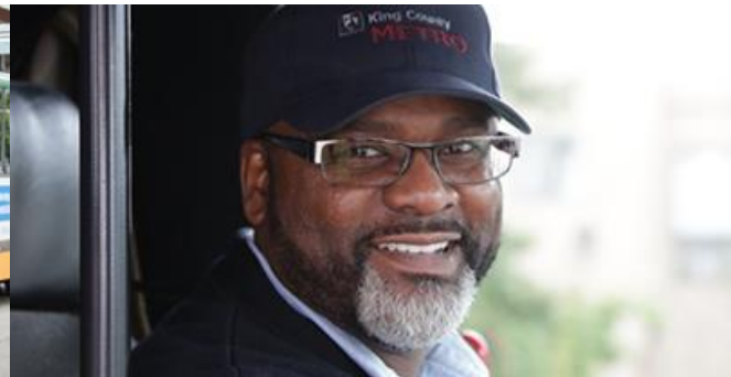
Culture of Innovation