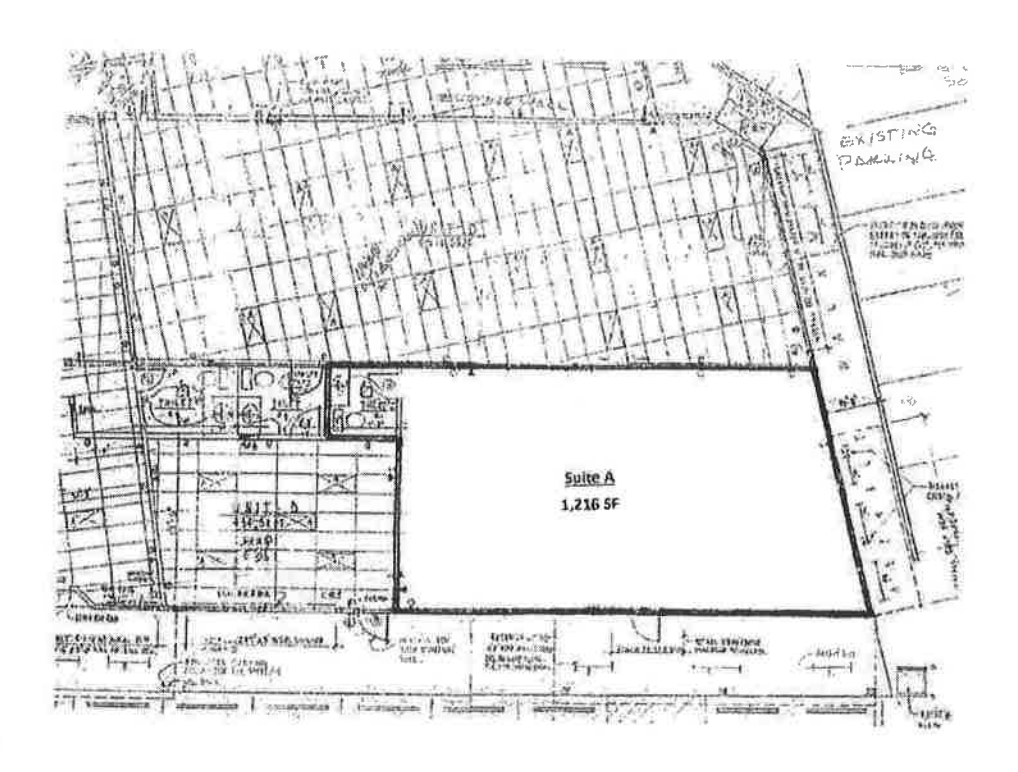
EXHIBIT B Diagram of Premises