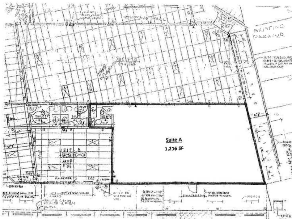
EXHIBIT B Diagram of Premises

Landlord Initial EEF Tenant Initial _____