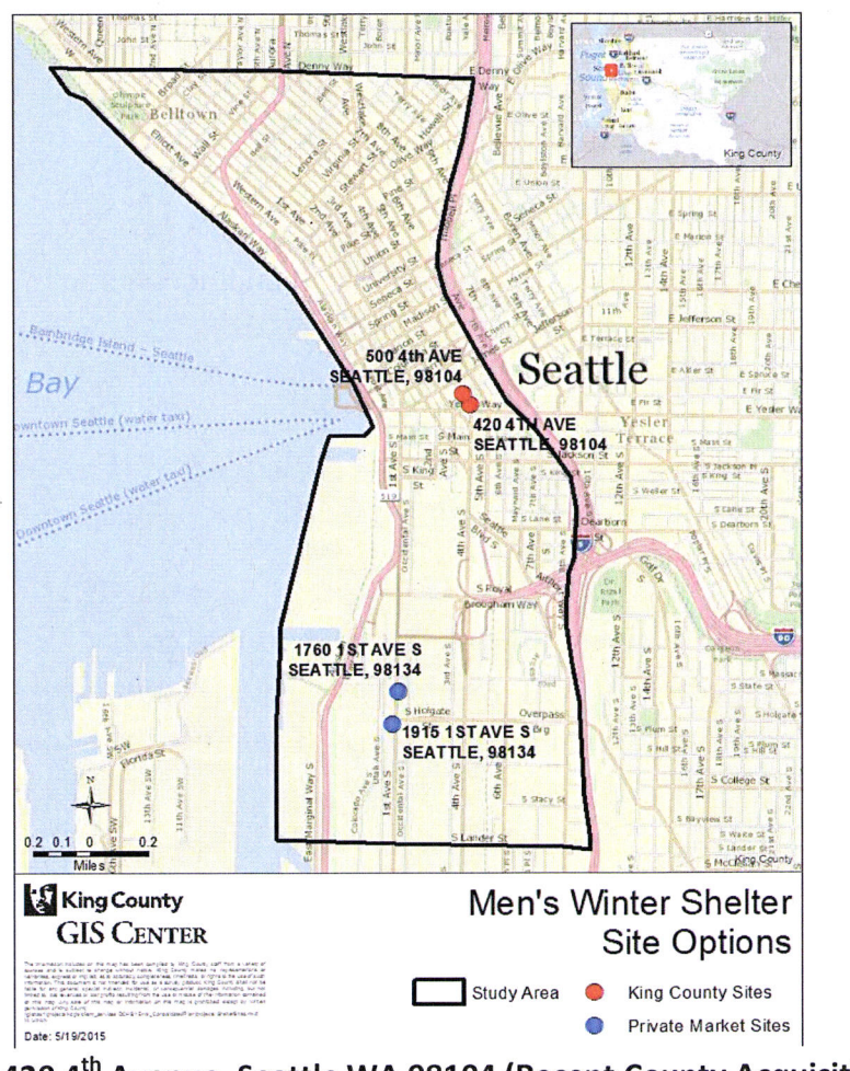
420 4<sup>th</sup> Avenue, Seattle WA 98104 (Recent County Acquisition)

This property is located in downtown Seattle in the Pioneer Square neighborhood. The three story standalone building is located directly south of the King County Administration Building.