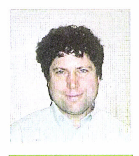
Title Area Construction Manager