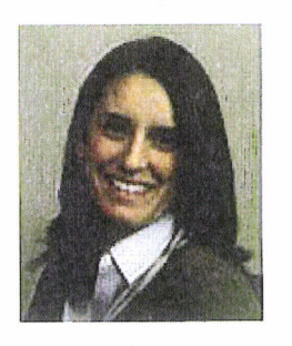
Title Technical Discipline Lead