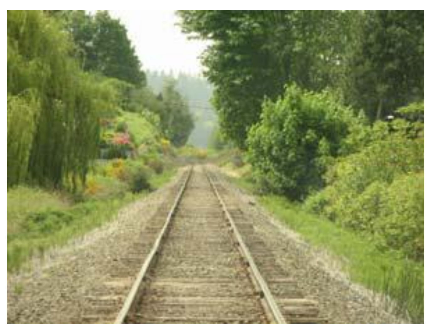
Prepared by King County Department of Natural Resources and Parks in response to King County Council Ordinance 17500 passed on December 10, 2012