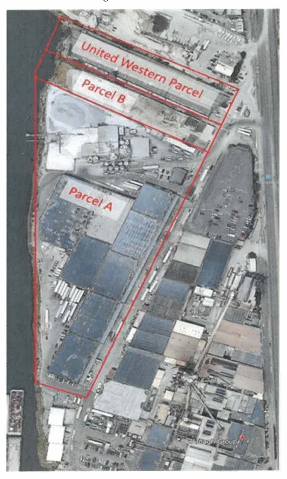
Exhibit B Diagram of the Premises