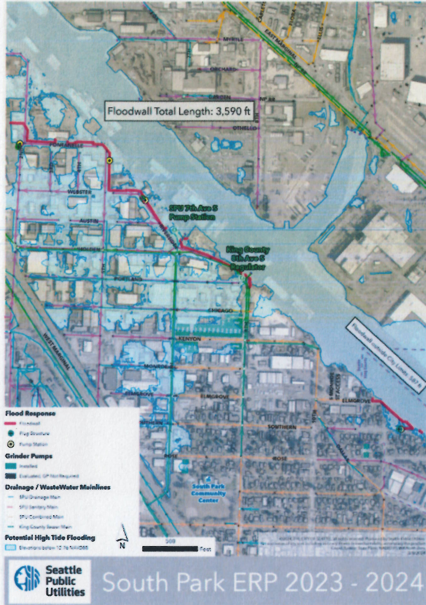
EXHIBIT A – PROJECT VICINITY MAP SOUTH PARK NEIGHBORHOOD