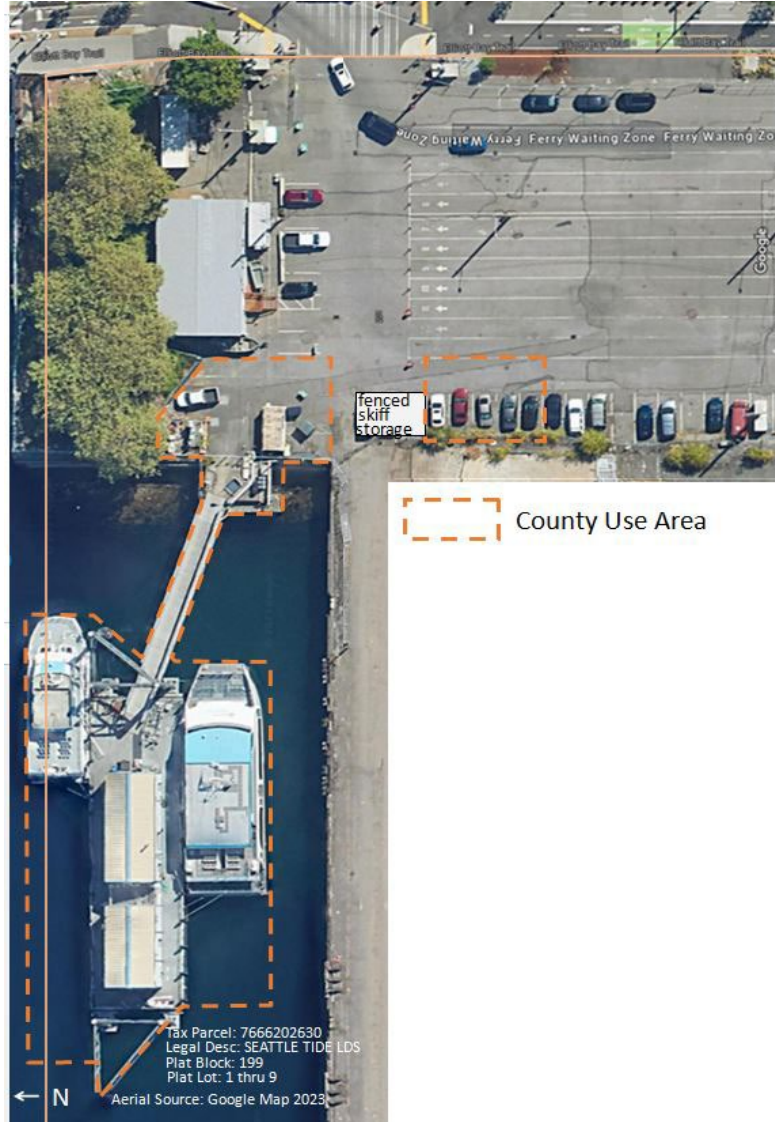
EXHIBIT A PIER 48 SITE PLAN 2024