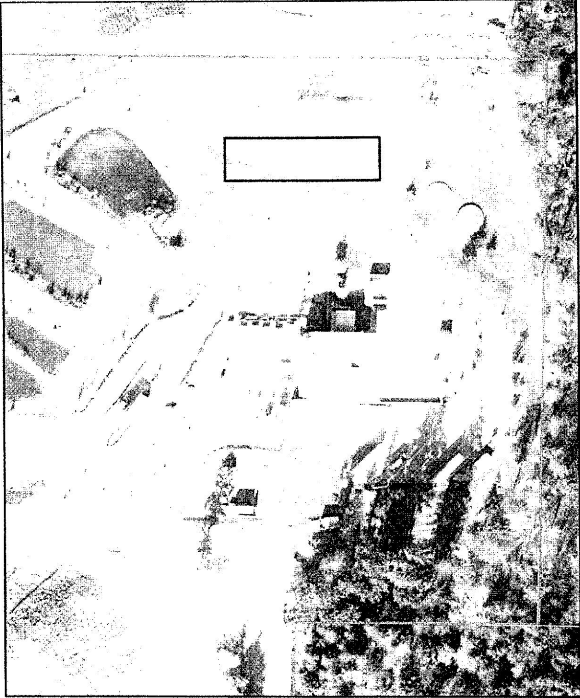
Vashon Transfer Station Property-Approximate location of Backbone Community Solar Project