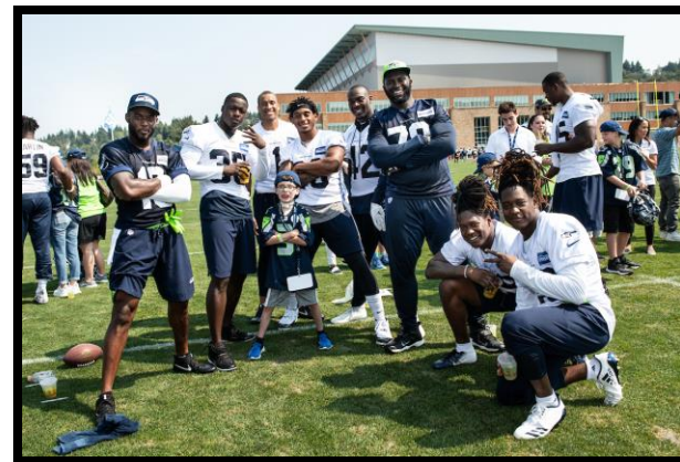
Make-A-Wish Day at VMAC