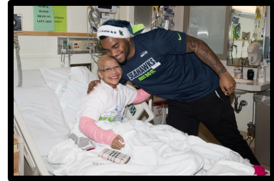
Captains Blitz at Seattle Children's