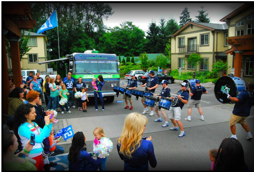
Sea Hawkers and Blue Thunder at Ronald McDonald House