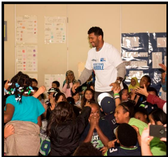
Russell Wilson at Hometown Huddle