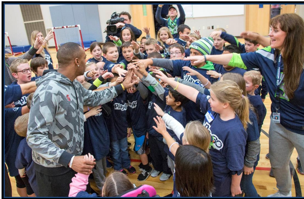
Doug Baldwin at Lakeland Hills Elementary for Play 60 Tuesdays