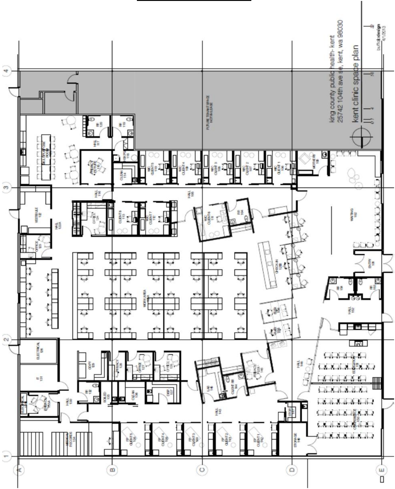
Exhibit E Preliminary Space Plan