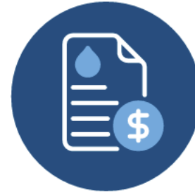
Customer affordability of wastewater services