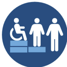
Equity & social justice