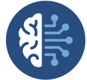
Digital technology & AI