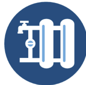
Pollution reduction & source control