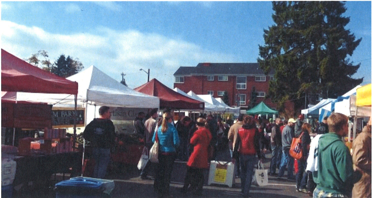
West Seattle Farmers Market