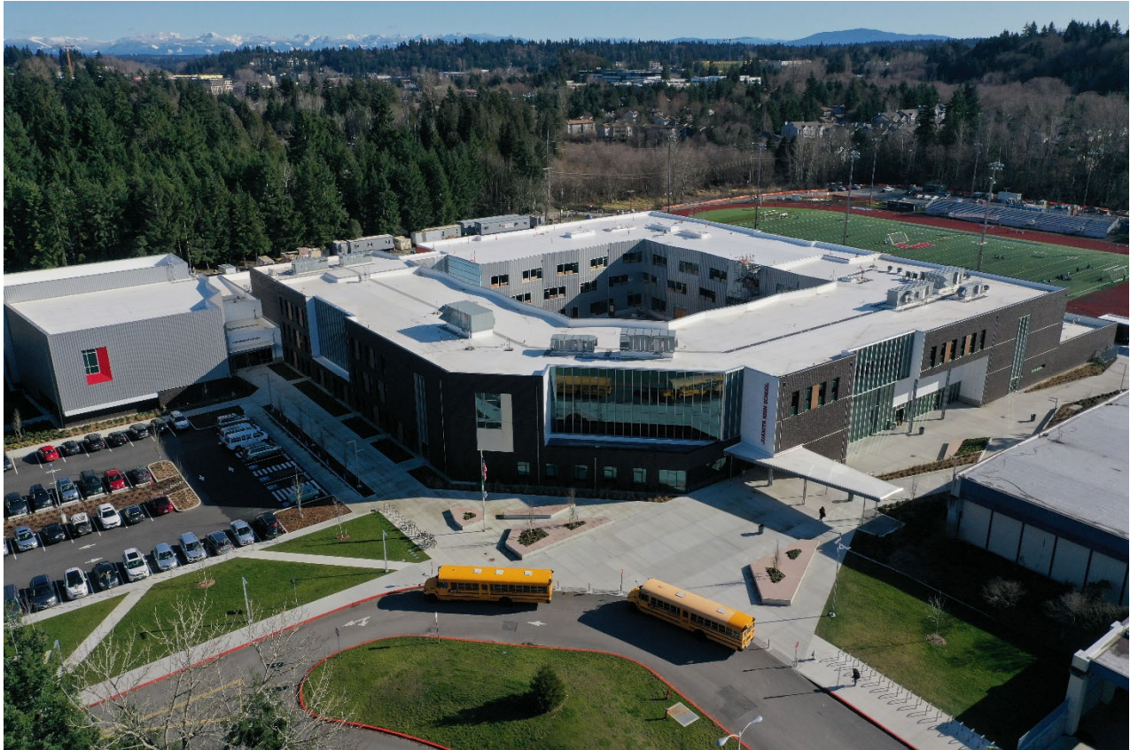
Juanita High School – Phase II To Open Fall 2020