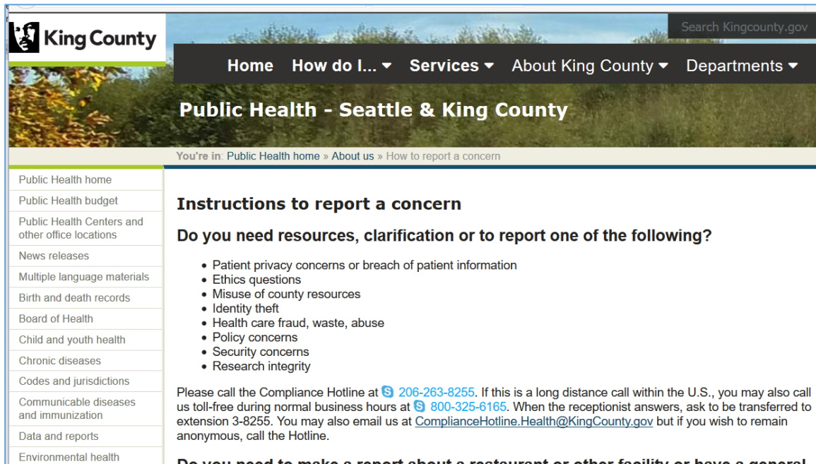
Figure 3: Department of Public Health HIPAA Compliance Contact

This link provides a number of contact methods as can be seen in Figure 3.