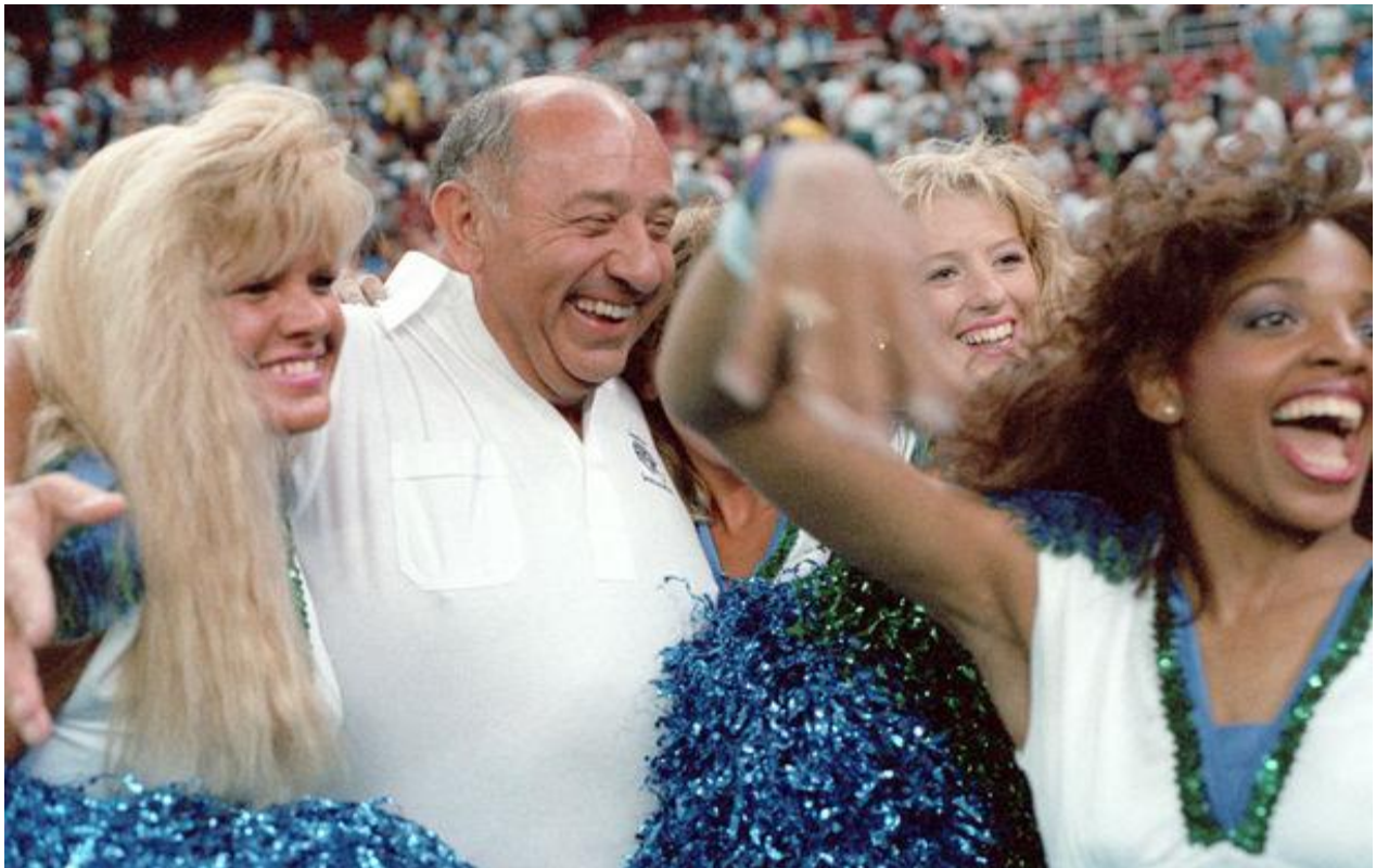
Ken Behring bought a Seahawks team that made the playoffs in 1988, but by 1996, his heavy-handed management style had failed and alienated the fan base.

"People today have a hard time believing the Seahawks were out of town," he says. "But they were. And quite frankly, there weren't a lot of people standing in front of the bus to stop them."