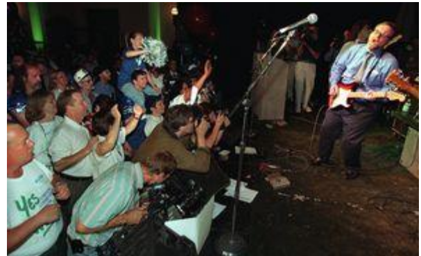
Paul Allen had reason to rock out once the stadium referendum appeared to pass in June 1997. "You put your name on the line," King County Councilmember Pete von Reichbauer told Allen.

As the night rolled on, votes from the Seattle area started tipping the scales in Allen's favor. When it was all over, the measure for a new stadium and exhibition hall narrowly passed with 51 percent of the vote . The taxpayers would contribute $300 million, Allen the remaining $130 million.