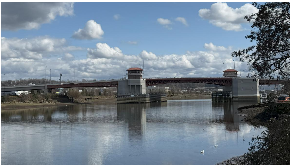
SOUTH PARK BRIDGE