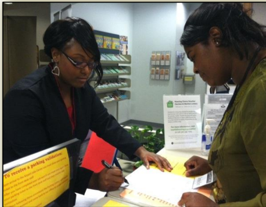
A JOB SEEKER LOOKS AT "HOTLIST" JOB OPENINGS AT THE AIRPORT

As a result of this support, jobseekers placed through our programs had an estimated annualized income of more than $21,000,000 in 2013.