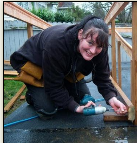
PREPARING FOR APPRENTICESHIP