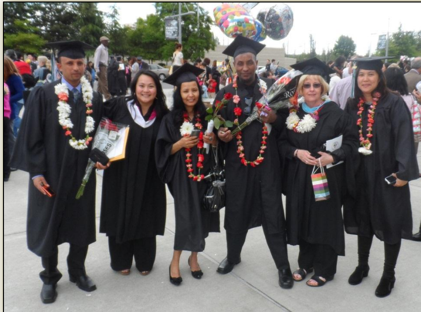
AIRPORT WORKERS EARN COLLEGE CERTIFICATES AT HIGHLINE COMMUNITY COLLEGE THROUGH AIRPORT UNIVERSITY

“Increase work force training, job and business opportunities for local communities in trade, travel and logistics.”