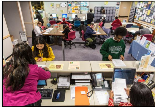
JOB SEEKERS LOOKING FOR WORK AT AIRPORT