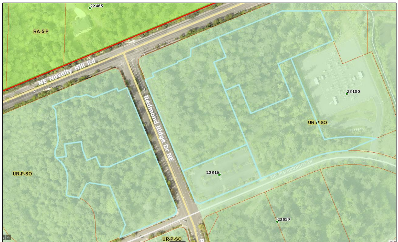
Figure 2: Zoning Classification (King County iMap)

Over the years, a number of modifications have been granted by King County in accordance with the permit modification provisions granted in KCC 21A.39.030.D and Section 3.1 of the UPD/FCC permit. The following table summarizes the requested modifications that directly relate to the permitted uses with the parcels within the Business Park.