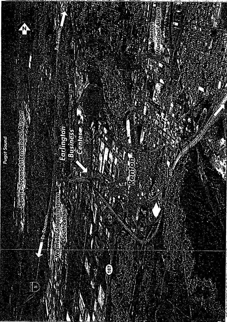
EARLINGTON BUSINESS CENTER AERIAL