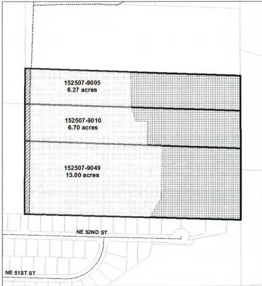
EXHIBIT B PROPERTY MAP