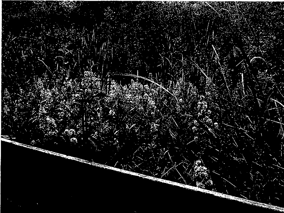
Garden loosestrife invading wetlands at Marymoor Park