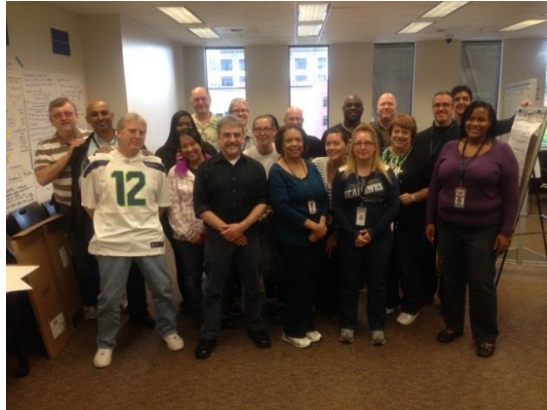
Kaizen Event Team: Pharmacy, Nursing, Medical and Psych JHS Staff and Lean facilitators